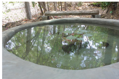
Figure 2: Pond at Isai Ambalam School.