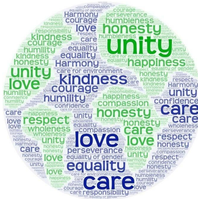
Figure 3: Values learned from celebration of festivals represented as a word cloud

For the second question, other than three children others could identify values or qualities in a few words they had learned through the festivals. We felt it best to represent it as a word cloud in Figure 3. In a word cloud, the words used more often are represented in larger fonts and others in smaller fonts.